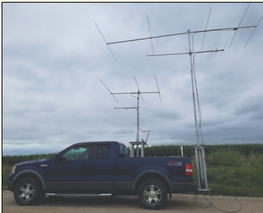
This is the improved ACØRA rover-mobile.