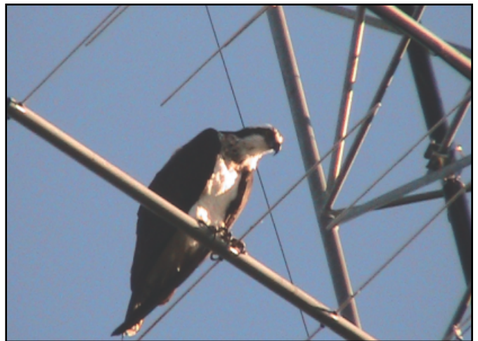
An osprey stopped to rest on one of K1HC's array of 144-MHz Yagis.

Even though it seemed that everyone was on FT8, there were other modes used during the contest. CW and SSB still work quite well. If things are really hopping on 313, there's an excellent chance that they are hopping on CW and SSB as well. Dig out the mic or paddle and make some Qs. I even found a headset with a microphone that works and made 18 Qs on SSB (many of which were multipliers), which is more than I often make in a whole year. There were also a couple of good CW openings.