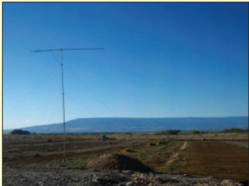
The view from DM58.