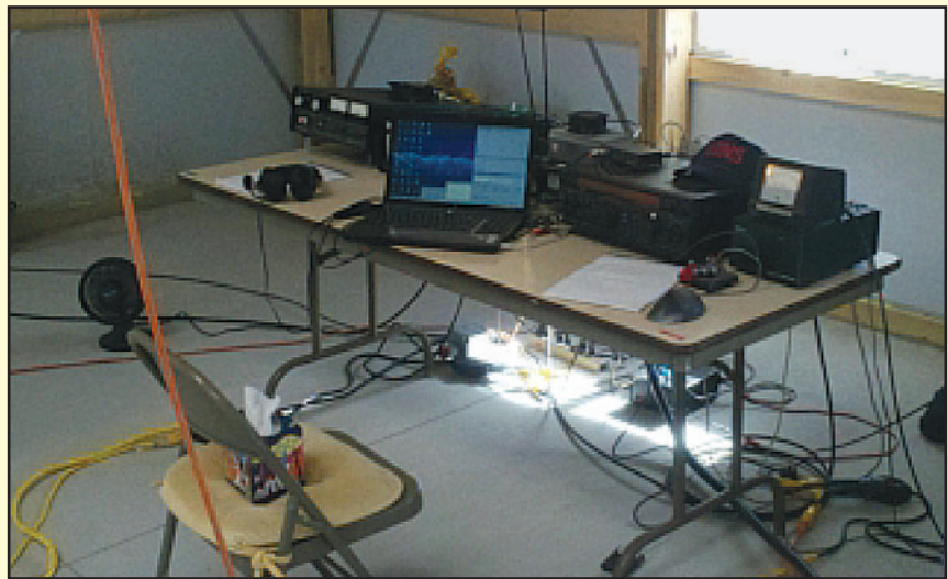
The W9RM operating position.

Saturday started strong, well ahead of my June score. Single-hop openings into the Midwest and the Pacific NW kept me busy well into the evening, but only a few double-hop QSOs were made. Sunday morning saw a repeat to the NW for about two hours, but then the band packed up and only scatter QSOs were made the rest of the contest. If the band had stayed, I'm sure 1000+ QSOs would have been in reach. Still, it was a fun experience even with only fair 6-meter conditions and I'll be back in 2013 with a better station!