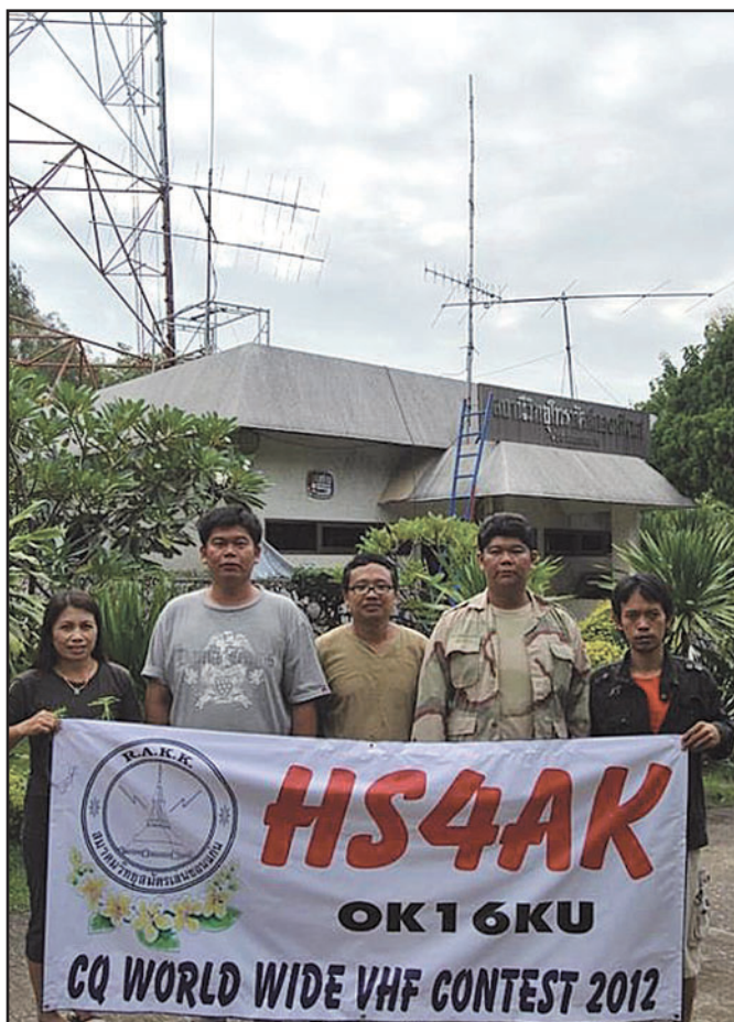
The operators at HS4AK.

Cabrillo is the preferred format that almost all logging software will export. If your logger does not export to Cabrillo (and most do), it probably does export an ADIF file. You can send that directly to me via e-mail and I can convert it to the required format, or there are several free converter programs that will do this for you. For those who create a paper log, if you have internet access you can type in your log at http://www.b4h.net/cabforms/cqwwvhf_cab.php . It is quick and simple to use and will submit your log to the robot for you. If all else fails, please send a copy